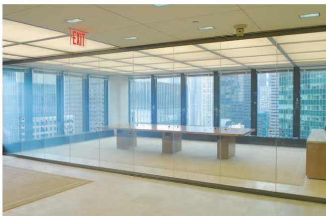
COMMERCIAL: Conference room with space-saving sliding doors.