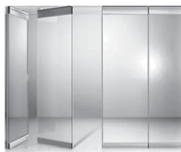
Slide & Stack