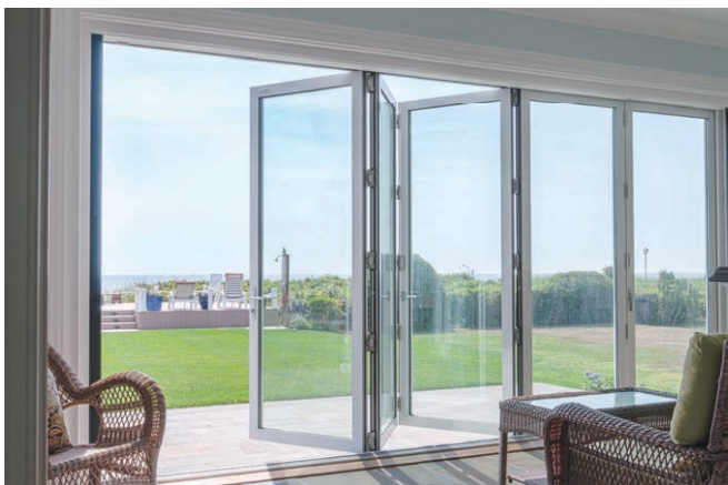
HOSPITALITY & RESIDENTIAL: LC Privacy Glass framing configurations include telescopic, bifold, and accordion openings.