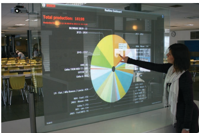
REAR PROJECTION: LC Privacy Glass partitions are an ideal surface for almost any large-format, multimedia, interactive display or presentation.