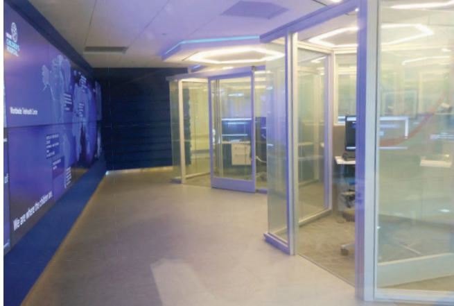
HEALTHCARE: Miami Children's Hospital — Multiple telemedicine hexagonal office pods.