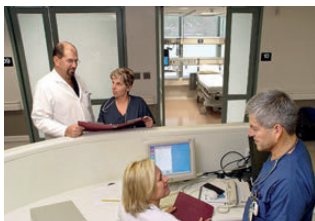
Intensive Care & Emergency Rooms

Versatile and cost-effective, LC Privacy Glass is the perfect solution for better patient outcomes and higher patient satisfaction scores that can result in increased service reimbursements and hospital revenue.