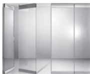
Slide & Stack