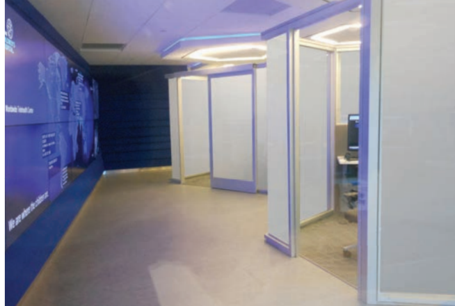
HEALTHCARE: Miami Children's Hospital — Multiple telemedicine hexagonal office pods.