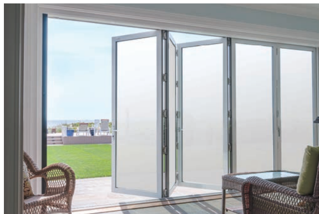
HOSPITALITY & RESIDENTIAL: LC Privacy Glass framing configurations include telescopic, bifold, and accordion openings.