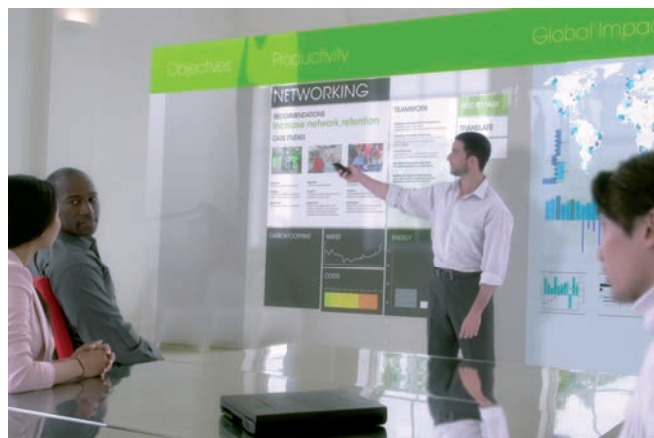
REAR PROJECTION: LC Privacy Glass partitions are an ideal surface for almost any large-format, multimedia, interactive display or presentation.