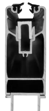
Reversible Saddle Positioned for 3/4" (19 mm) Clearance