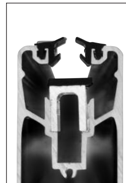
Top Load E.P.D.M. Glazing Gasket