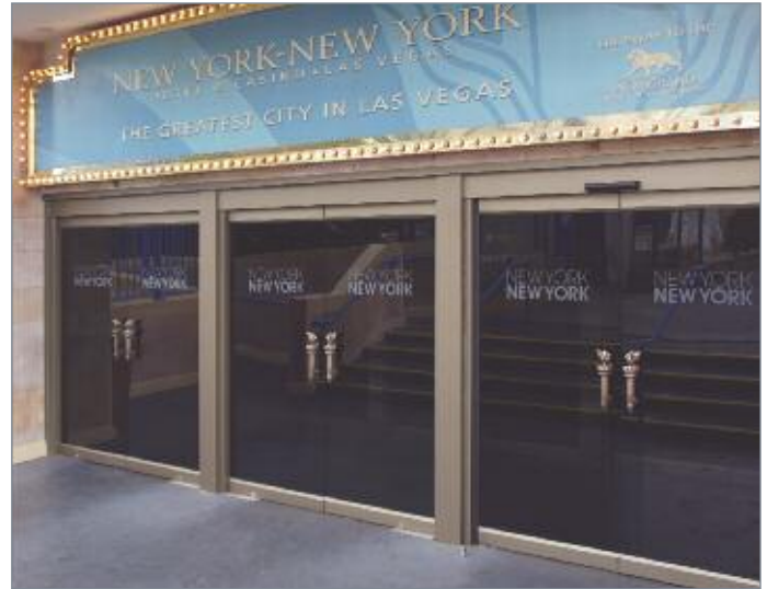
Patented Wedge-Lock™ Glass Securing System U.S. Patents 6,434,905 and 6,912,818 B2. Foreign Patents Pending